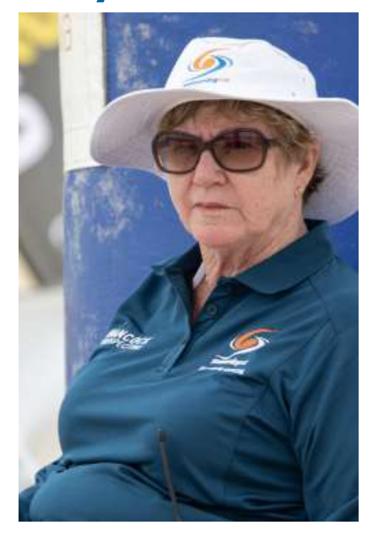
30 years of Service