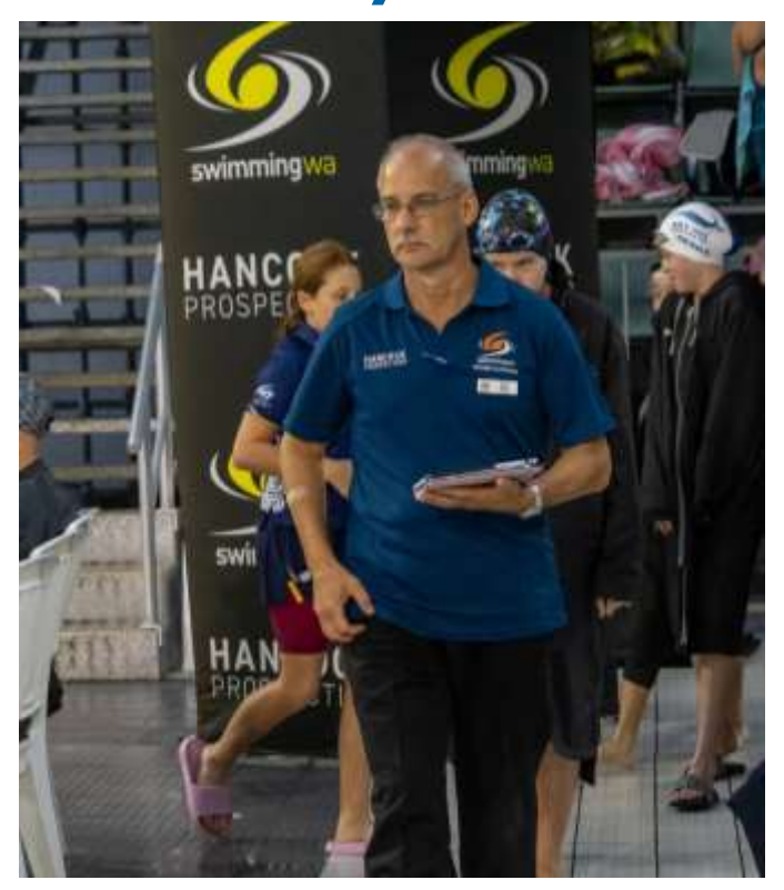
25 years of Service